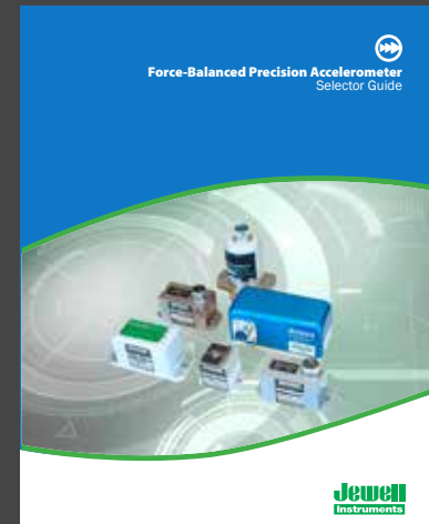
Force-Balanced Precision Accelerometer Selector Guide