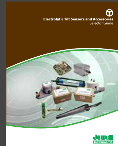
Electrolytic Tilt Sensors and Accessories Selector Guide

Jewell Instruments is a world leader in the manufacture and distribution of panel meters, avionics components, inertial sensors, and precision solenoids. From sales and design, manufacturing and testing, and delivery and support, Jewell Instruments offers complete customer care and engineering expertise. We also offer two, fully modernized manufacturing facilities, one in Manchester, New Hampshire and one in Barbados, West Indies to handle the most stringent manufacturing requirements with a cost-competitive advantage.