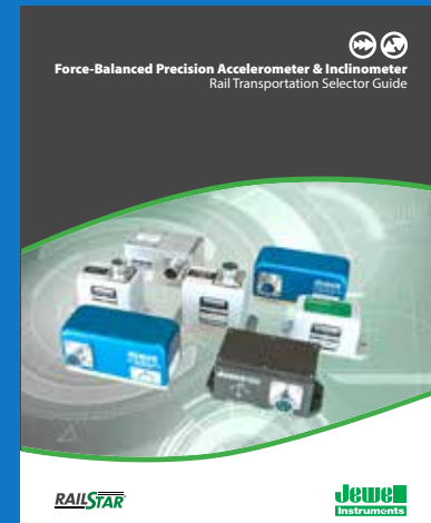
Rail Transportation Selector Guide