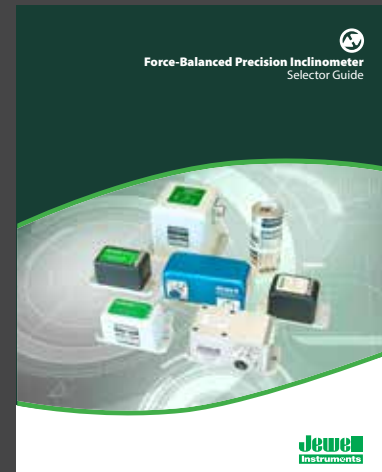
Force-Balanced Precision Inclinometer Selector Guide